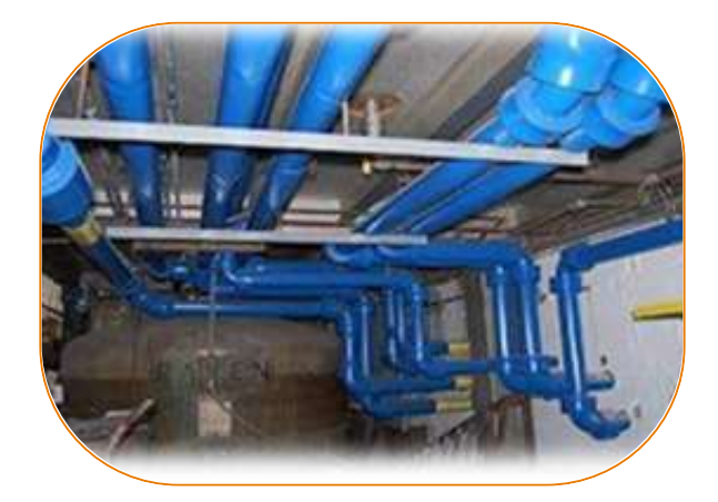
Piping Fabrication & Installation