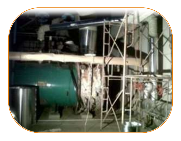
Steam Tank Installed at Gatron Industries Ltd